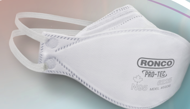
Particulate Filtering Medical N95 Respirator, Flat Folded