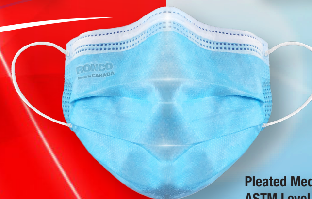
Pleated Medical Masks ASTM Level 1, 2 and 3