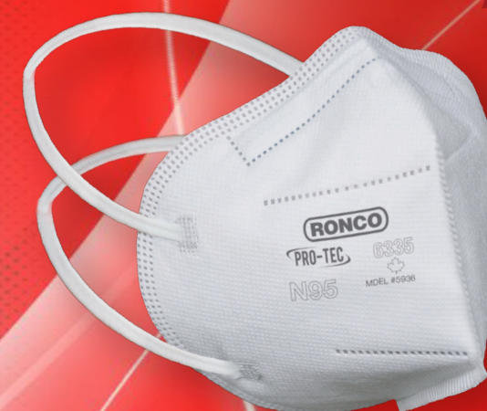
Particulate Filtering Medical N95 Respirator, Vertical Folded