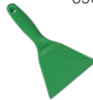
Remco 4" Hand Scraper 6962x