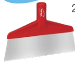
Vikan Stainless Steel Floor Scraper 2910x