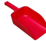
Remco 82 Oz. Hand Scoop 6500x